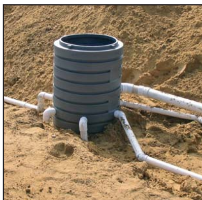
A riser with 6-outlet Multizone valve to sequentially dose the distribution cells.

installed and the first coat of asphalt applied to the parking lot before the ground froze,” says Bergh. “The contractors wanted to complete the hotel in spring, and not deal with frost issues or us getting in their way.”